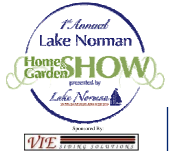
Exhibit Location: Charles Mack Citizen Center 215 N. Main St. Mooresville NC 28115

I would like my exhibit located in the following area of the show: Lowrance, Burlington . Moore (8' deep X 10' wide)