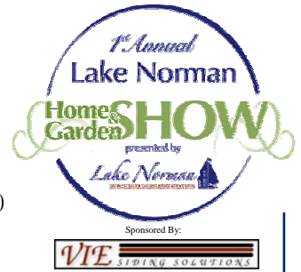
Exhibit Space Rates ~ Deadline for Early Bird Registration February 15, 2008 Deadline for Entry is March 14, 2008